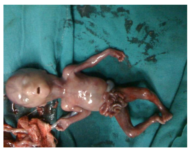
Fig 3: Post delivery photograph showing abdominal wall defect with herniation of bowel loops and no covering membrane.