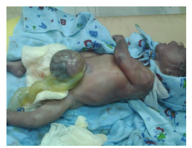
Fig 4: Post delivery photograph showing abdominal wall defect with herniation of bowel loops and liver covered with a membrane. Umbilical cord is seen inserting into the center of the covering membrane.

10,000 births and is stable.<sup>2-4</sup>