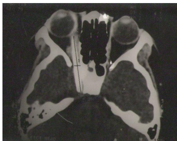
Figure 1: Plain axial CT scan of orbit showing long elongated foreign body in right orbit passing through optic foramen in to cavernous sinus.

There have been several reports on retained orbitocranial foreign body in the orbit in neurosurgical literature 1-5 . However, there is a scanty report in ophthalmic literature to highlight its importance 6-8 . The mortality rate of penetrating orbital injuries with intracranial involvement is twofold than those associated with cranial wounds at other sites 9 . Retention of ultra orbital foreign bodies besides producing cranial nerve injury could be a cause of proptosis due to mechanical push. The potential risk of such foreign bodies include intracranial infection, aneurysms, haematoma, intraventricular hemorrhage, brain stem injury, carotid cavernous fistula etc 10 . Moreover, chances of