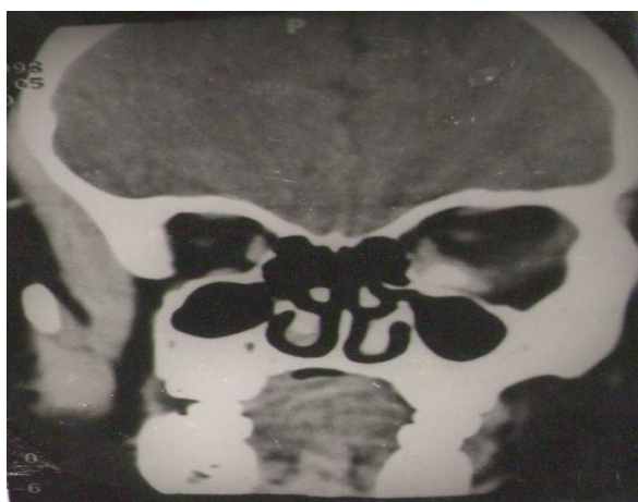
Figure 3: Plain coronal CT scan showing foreign body in infero-medial part of orbit.

development of siderosis, chalcosis do exist depending upon the nature of the foreign bodies. The asymptomatic foreign body such as glass should be left behind and to be followed up. However, considering the risk of inflammation and infection leading to orbital cellulitis, abscess, (which could be fatal) more attention should be paid to the organic foreign bodies and their removal is mandatory. Our report is partially concurrent with that of literature that the penetrating orbital injuries occur more often through the lower orbital region due to least anatomical protection 11 as the foreign body was lodged medially in our patient. However,