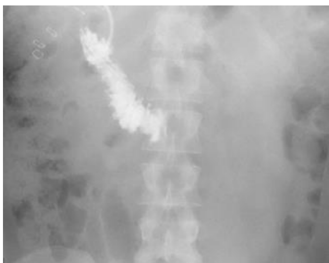
Figure 1: Anteroposterior view during initial phase of T-tube cholangiogram showing free and prompt passage of the contrast into the D2 segment of duodenum with 'T' point (long arrow) of T-tube lying in its lumen

Later, the patient was asked to drink 500 ml of red-coloured fruit juice, 400 ml of which was promptly drained via a T-tube, further confirming its location in the gut. The patient tolerated the clamping of the T-tube well which was removed by gentle traction.