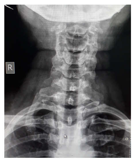
Figure 2: Right cervical rib.