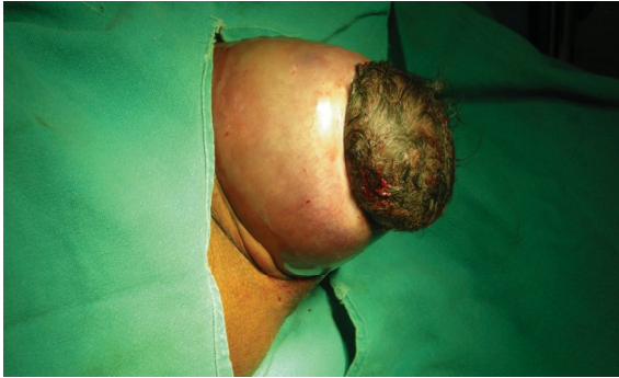
Fig 1. Huge nulliparous prolapse in second stage of labour with head being obstructed by tight cervical rim (cervical dystocia) leading to big caput succedaneum formation.