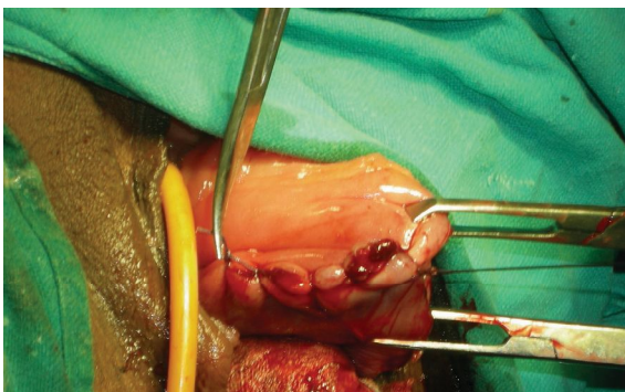
Fig 4. Dührssen's incision completely stitched.

outside the vulva. The cut edges of the incision were grasped with tissue holding forceps and stitched by continuous sutures of vicryl. She was discharged after 72 hours of hospital stay without any complications.