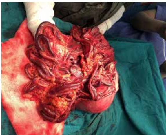
Figure-2: Mass of 26 x 24 cm torturous dilated serpentine vessels running over omentum anterior to the mass

In view of vascular mass of uncertain origin laparotomy was performed keeping vascular surgeons standby if needed. On opening abdomen it revealed abundant torturous dilated serpentine vessels running over omentum which was adhered to anterior surface of the mass and on further exploration solid mass of 26 x 24 cm occupying whole abdomen was present [Fig-2].