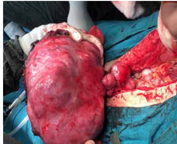
Figure-3: Subserosal myoma arising from the fundus of uterus with small avascular pedicle with three buddings of 3x3 cm in posterior surface of mass.

Omentum was adhered to the anterior surface of the mass and blood vessels were derived from omentum suggesting its blood supply from it. Mass was arising from the fundus of bulky uterus with small avascular pedicle thus was subserosal in nature. Three buddings of 3x3 cm noted in posterior surface of mass [Fig-3].