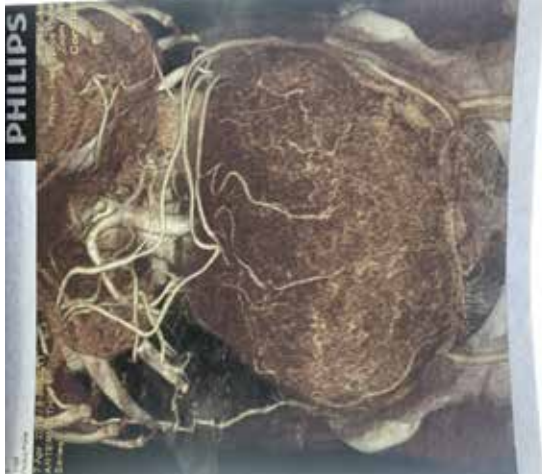
Figure-1: CT angiography showing mass with anonymous branches of superior mesenteric artery with multiple collateral vessels and multiple feeders supplying the mass.

feeders supplying the mass likely from the inferior pancreaticoduodenal and right colic artery [Fig-1].