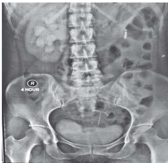
Figure 4: IVU showing nonopacification of left renal system with moderate hydronephrosis due to right distal ureteric stenosis caused by B/L involvement of ureters by endometriosis.