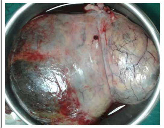
Figure-1: Gross specimen of left ovarian tumor

clear fluid (total fluid-1500 ml); solid component of around 5x5 cm was also seen [Figure-1, 2 and 3]. Her post-operative period was uneventful and she was discharged from the hospital on 12 th post operative day.