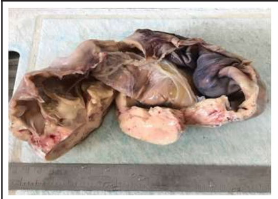
Figure-2 & 3: Cut section of tumor showing the solid component

Histopathological examination showed tumor cells arranged predominantly in inter-anastomosing trabeculae of ribbon, cords and sheets while few cells were arranged in micro-follicular pattern. The tumor cells were forming microcystic spaces containing