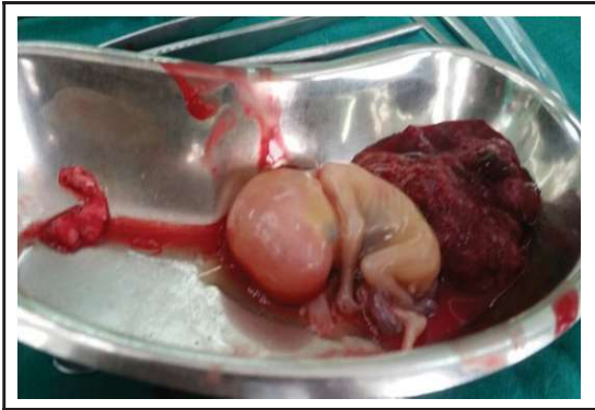
Figure-2: Single non-viable male fetus with placenta.

ruptured cornual region. The rupture measured 10-12 cm in length and placental tissue protruding through it. Normal left fallopian tube and both ovaries were normal. Three pints of whole blood was transfused. Postoperative period was uneventful and she was discharged on third postoperative day in good condition.