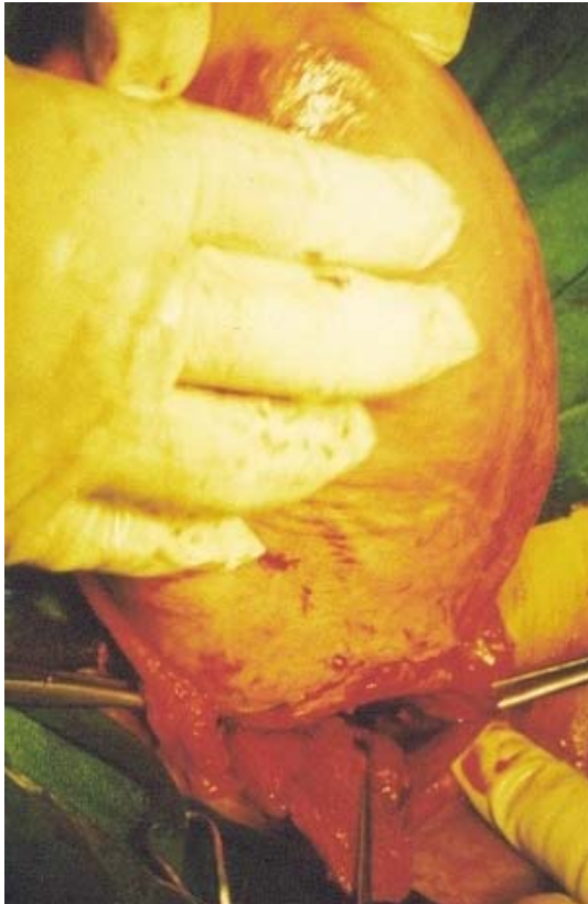
Figure 1. Uterine inversion reverted at laparotomy.