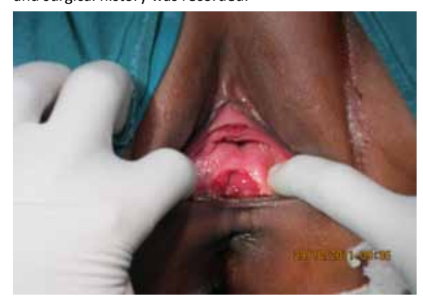
Figure 5. RVF of 2x2 cm, 1.5 cm above the introitus in a case of chronic PID

A 37 years parous lady presented with complaints of stool coming from vagina for last one month specially during passage of loose stool. She was para 2+0, both delivered vaginally with episiotomy at home 20 and 17 years back respectively. There was no history of prolonged labour or operative or traumatic vaginal delivery. The post partum periods on both occasions were uneventful. Her menstrual history was normal. Occasionally she had excessive white vaginal discharge, dysuria and pruritus vulvae. Though she had undergone repeated treatment but never cured permanently. Six months ago she was detected HIV positive and was on anti retroviral therapy (ART). HBV, HCV and VDRL was nonreactive. No other significant medical and surgical history was recorded.