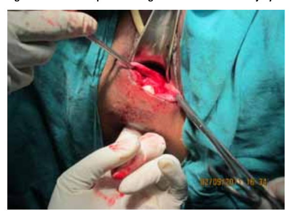
Figure 2. 5x1.5cm rent extending upto rectum admits tip of the examining finger through rectum