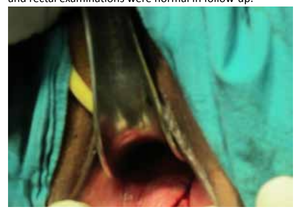
Figure 1. Rent in the posterior vaginal wall due to coital injury

low recto-vaginal fistula (traumatic) was made and the fistula was repaired transvaginally in two layers. Rectal wall mucosal defect closed by interrupted stitches and the seromuscular layer by continuous stitches with 3-0 vicryl. Vaginal gap was closed by continuous suture with 3-0 vicryl. Per operatively one unit of whole blood was transfused. The post operative period was uneventful. Patient became continent of flatus and faeces. Her vaginal and rectal examinations were normal in follow-up.