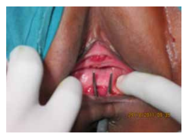
Figure 6. Rent was felt continuous with vagina in the RVF following chronic PID

On examination her vitals and per abdomen examination were normal. On per speculum examination cervix looked congested and with profuse discharge but no bleeding. On per vagina examination there was a small rent about 2x2 cm, 1.5 cm above the introitus (Fig 5) through which stool was coming out. Her uterus and adnexa were normal. On per rectal examination the rent was felt continuous with vagina (Fig 6), without any other rectal anomalies.