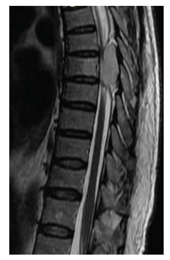
Figure 2: Sagittal T2W MRI image showing homogeneously hyperintense lesion in epidural space along with hyperintensity in D7 vertebral body.

Final histo-pathological report was suggestive of Cavernous Hemangioma.