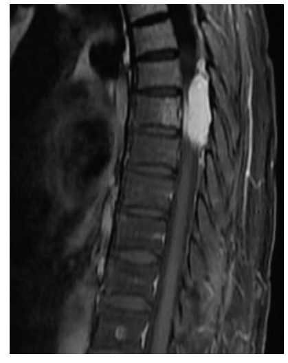
Figure 3: Sagittal post-contrast MRI image showing brilliantly enhancing epidural lesion spanning 3 vertebral segments (D6 to D8).

Final histo-pathological report was suggestive of Cavernous Hemangioma.