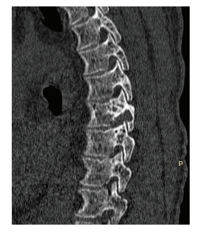
Figure 5: Sagittal CT image showing widening of left neural foramen of D7 vertebra along with erosion of bone.

Cavernous hemangiomas are benign vascular lesions of congenital origin found throughout the central nervous system. They are mostly encountered as intra-parenchymal lesions in the supratentorial compartment<sup>8,9,10</sup>. They make up 3 to 16% of all spinal vascular lesions<sup>5,9,10</sup>. Spinal cavernous hemangiomas usually originate from the vertebral body and may present in the epidural space through secondary extension. Pure epidural cavernous hemangiomas are a rare entity and they account for 12%