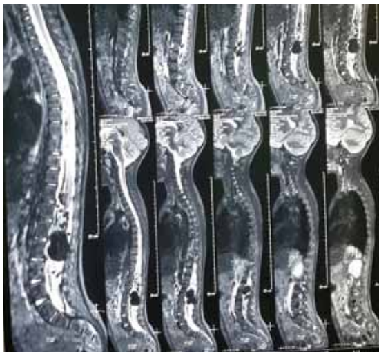
Figure 1a: Pre-operative MRI of whole spine (STIR sequence)

Her post-operative periods were uneventful. Repeat spinal angiography showed obliteration of AVM. Her bowel and bladder habit were normal and she was discharged without neurological deficit on the 14 th post-operative day with thoraco-lumbar brace. At six months of follow-up patient was asymptomatic without any neurological deficit.