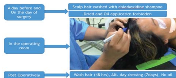
Figure 1: Preoperative Part Preparation (PPP) method

In the PPP group, all patients were instructed to wash their scalp hair with chlorhexidine shampoo a day before and on the day of surgery (Figure 1).