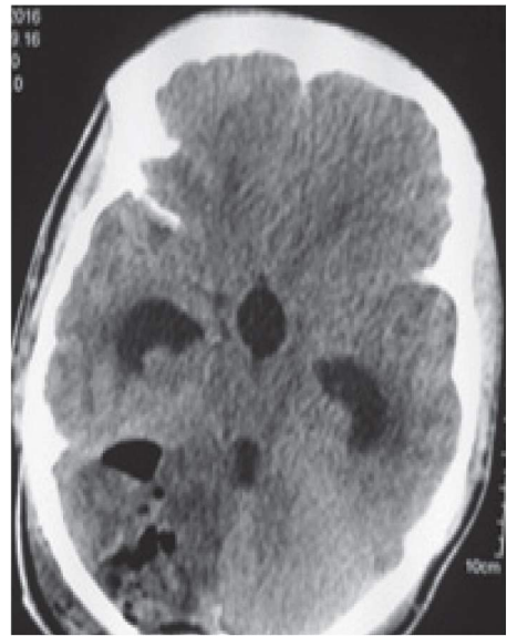
Figure 3: Postoperative Non-contrast CT Head showing pneumocephalus and minimal blood within the right cerebellar hemisphere

Lhermitte-Duclos disease (LDD) is a rare condition usually affecting patients aged 30-50 years. There is no sex (male to female ratio = 1) or race preference. 2 Lhermitte and Duclos reported the first case of cerebellar ganglion cell tumor in 1920. Exact cause of this disease is still a matter of controversy. Origin of the disease has been postulated as a hamartomatous, neoplastic, or congenital malformative. 2 This is often associated with other anomalies and malformation, like macrocephaly, megacephaly,