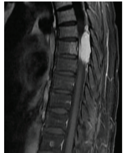
Figure 3: Sagittal post-contrast MRI image showing brilliantly enhancing epidural lesion spanning 3 vertebral segments (D6 to D8).