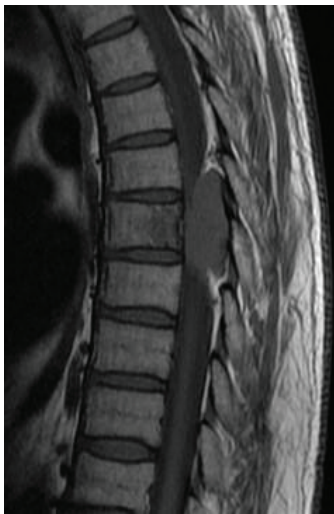
Figure 1: Sagittal T1W MRI image showing hypointense posterior epidural soft tissue lesion in thoracic spine.

Final histo-pathological report was suggestive of Cavernous Hemangioma.