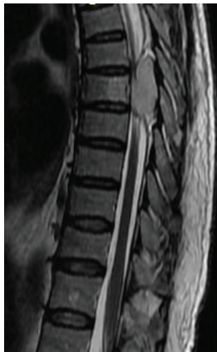
Figure 2: Sagittal T2W MRI image showing homogeneously hyperintense lesion in epidural space along with hyperintensity in D7 vertebral body.