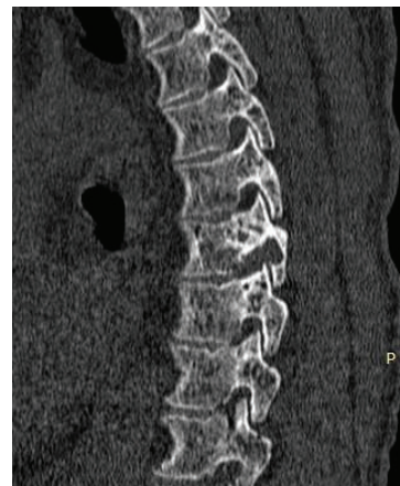
Figure 5: Sagittal CT image showing widening of left neural foramen of D7 vertebra along with erosion of bone.