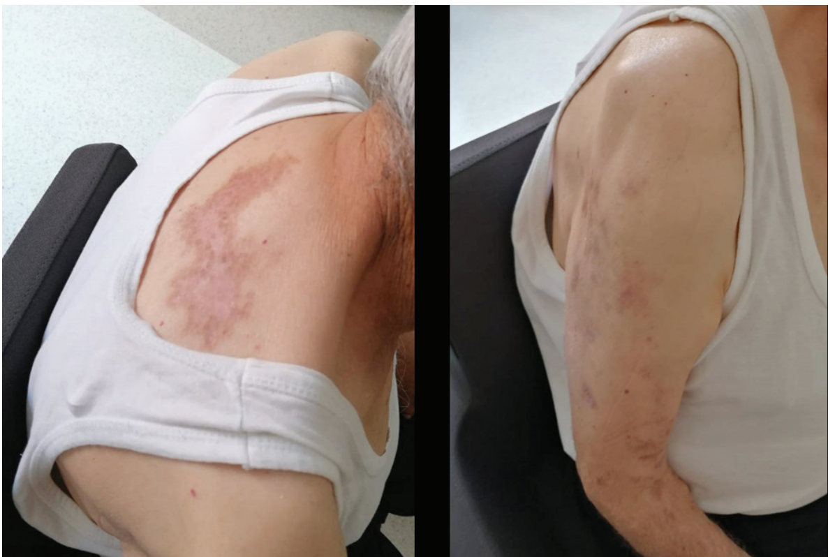
Figure 1: The images showing partly resolved vesicular rashes on C4-8 dermatomes.

Taken together, the diagnosis of herpes zoster and associated segmental zoster paresis was established and based on the findings of EPS, the pathology was classified as radiculopathy and/or anterior motor neuron affection. The patient was referred to the dermatology clinic. Although he had received therapy for herpes zoster 1.5 months ago, valacyclovir 3x1 gm was initiated over the 7 days and low dosage methylprednisolone 40 mg daily was also initiated and administered over the following two weeks by tapering the dose. A significant recovery in paresis was achieved following initiation of treatment and such that at the follow-up visit after two months, the patient could use his hand nearly as the pre-morbid state (proximal muscle strength of right upper extremity: 4/5, distal muscle strength: 4+/5).