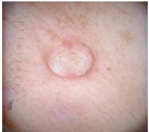
Figure 2: Dermoscopic findings of arborizing vessels with brownish pigmentation overlying a whitish to pinkish background

Dermoscopy of the lesion was done with DermLite DL1, which revealed arborizing vessels with brownish pigmentation overlying a whitish to pinkish background. (Figure 2) The lesion was surgically removed and was sent for histopathological evaluation. Histopathology revealed encapsulated tumor with proliferation of spindle cells in the dermis. There was presence of hypercellular (Antoni A) and hypocellular areas (Antoni B). Hypercellular areas showed spindle shaped cells arranged in fascicles. The cells had elongated to wavy nuclei and fibrillary cytoplasm. Occasional areas of nuclear palisading were also noted but classic Verocay bodies formation were not seen. (Figure 3 A and B)