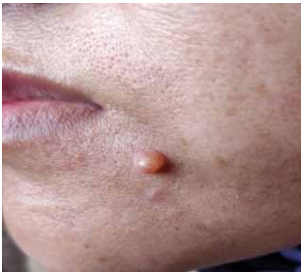
Figure 1: Skin colored, dome-shaped nodule present on the left side of the chin

On examination, it was rounded, circumscribed, dome-shaped skin colored nodule, 7 mm in size, firm in consistency, non-tender near left side of chin. There was no discharge and ulceration. (Figure 1) Our clinical differential diagnosis was Eccrine poroma, Trichofolliculoma, Dermal mole, Fibroepithelioma of Pinkus (a variant of Basal cell carcinoma) and epidermoid cyst.