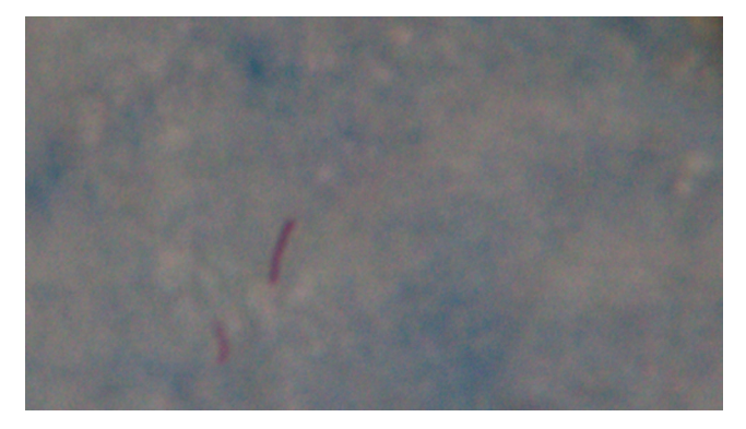
Fig-2:Photo micrograph showing AFB (x 1000 Z.N. Stain)

Discussion : Tuberculosis is a rare disease of breast with incidence ranging from 0.025% to 0.1% in developed countries and up to 0.3% to 5% in endemic region.<sup>1,2</sup> Majority of reported cases involved young multiparous females of 20 to 40 yrs age group owing to constant physiological changes of the gland in this age group with increased susceptibility to trauma and infection.<sup>1,2,7,8</sup> Pregnancy and lactation further enhance chance of acquiring infection due to increased vascularity and dilation of ducts predisposing to trauma.<sup>2,7</sup> Male breast can also be affected though infrequently.<sup>2,5,6</sup> Present patient under discussion was young, multiparous and non lactating.