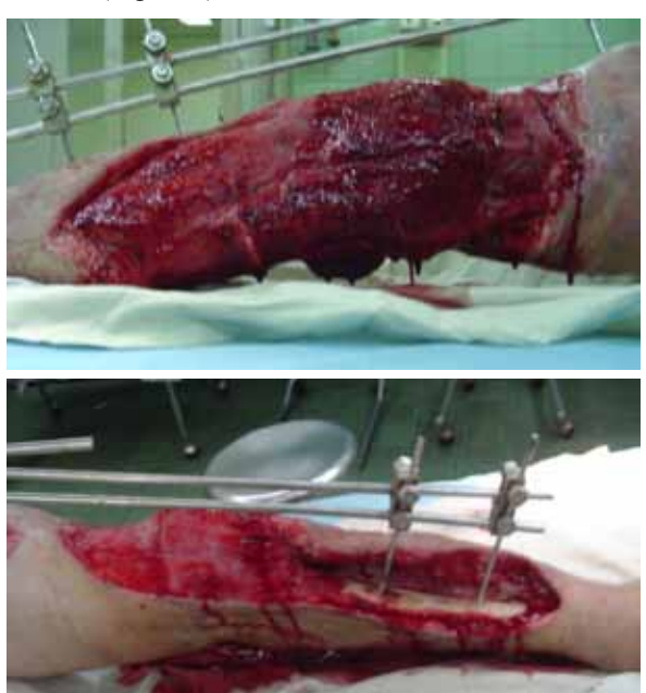
FIGURE 5: Patient with Open III-C Distal Femur Fracture with popliteal artery injury associated with tibia and fibula fracturewho underwent Popliteal Artery Bypass Grafting – note large leg avulsion with exposed tibia. However, it was the Popliteal Artery Bypass Graft that failed at 3 weeks, resulting in amputation.

Next patient was an open type III distal femoral fracture with popliteal artery bypass grafting and associated tibia and fibula fracture. Modified NPWT was set up over the external fixator, extremity developed gangrene due to failure of the popliteal artery bypass after 3 weeks. Patient underwent above knee amputation because of the gangrene. Healthy granulation tissue was observed at the open fracture site. This demonstrated the ability of modified NPWT to stimulate regeneration therefore not truly a failure of the procedure (Figure 5).