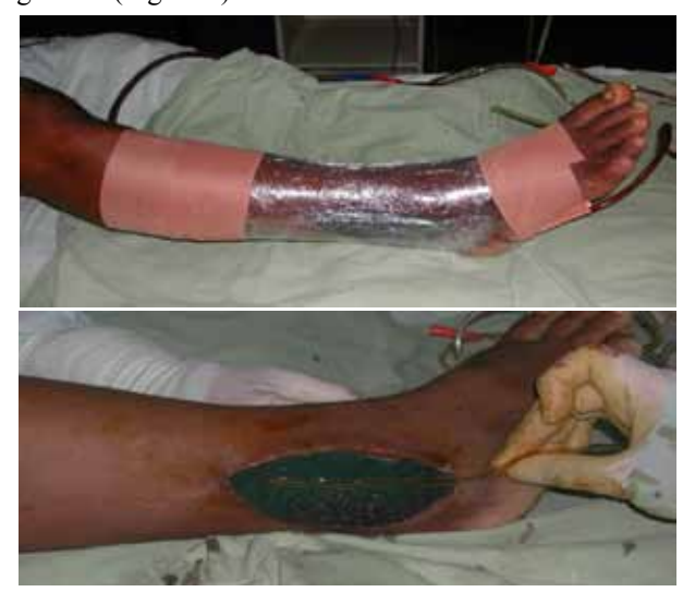
Figure 2: Foam is cut with a metz scissor in the shape of the wound. A Nasogastric tube or an infant feeding tube is placed in a tunnel of the foam. It is then wrapped by Saran®wraps. The edges are obliterated by using Leukoplast® plaster tapes thus making it a sealed dressing

A pre-sterilized Saran® wrap or Glad® wrap (Ioban®, Steridrap® or any brand of barrier drape) was wrapped around the area. The ends of this seal were then obliterated by applying Leukoplast® plaster tapes thus making it an air tight seal (Figure 2).