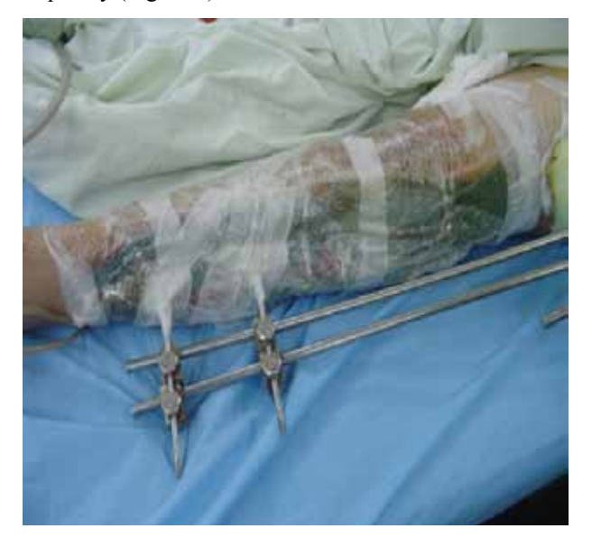
Figure 3: Applying VAC around a external fixator requires an extra effort. The Saran® wrap are slit cut around the pins. Leukoplast® plaster tapes has to be properly applied around the pins so as to make it a sealed dressing.

The tube was then connected to the suction to check if the foam collapses, if not then we looked for any unsealed area then sealed it with more plaster tapes. In cases of external fixators, slit cuts on the Saran® wraps were made to seal pin sites and tapes around the pin sites sealed the area adequately (Figure 3).