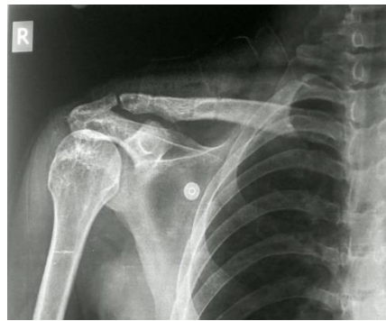
c. After implant removal