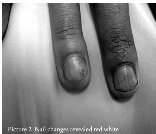
Picture 2 Nail changes revealed red white