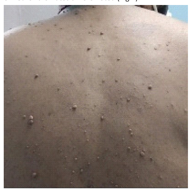
Fig.2. Multiple pedunculated Neurofibroma over upper and lower back

Multiple soft to firm subcutaneous swellings suggestive of neurofibromatosis were noted (Fig 2).