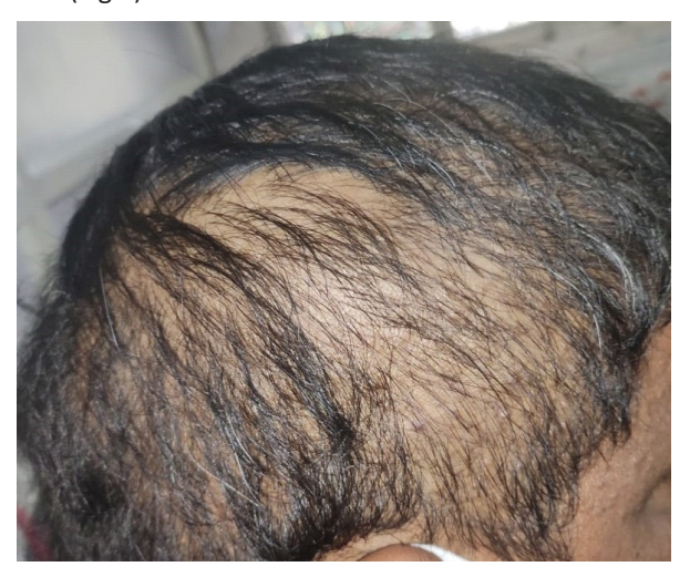
Fig 5. Sudden onset alopecia following Azathioprine

He however complained of sudden onset diffuse hair loss (Fig 5).