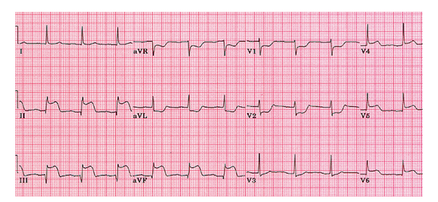
Figure 2: The ECG showing ST elevation in the inferior leads i.e. II, aVf and III and reciprocal ST depression in V1 and V2