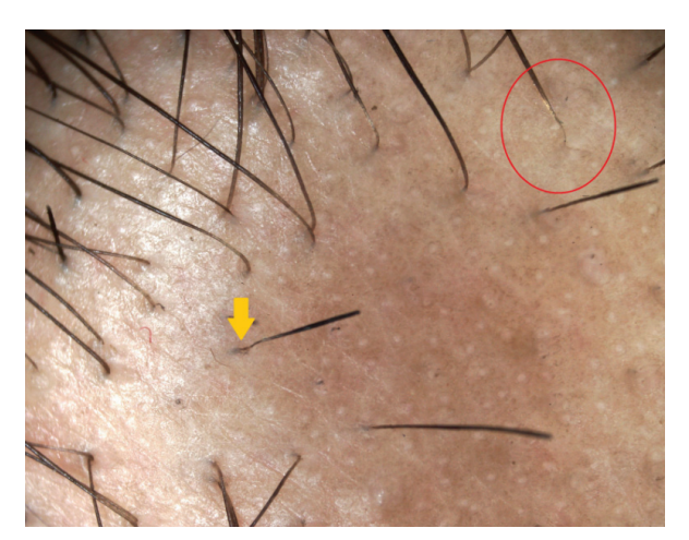
Figure 1: Exclamation hair- yellow arrow