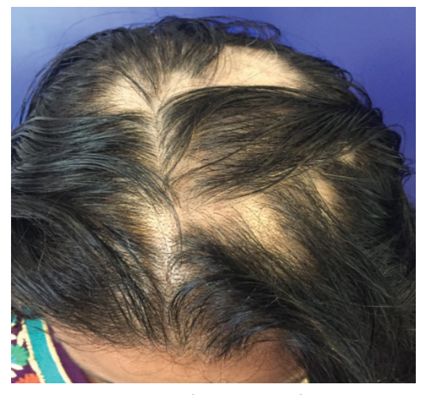
Figure 3: Baseline and after 6 month of treatment with AZT+MPT