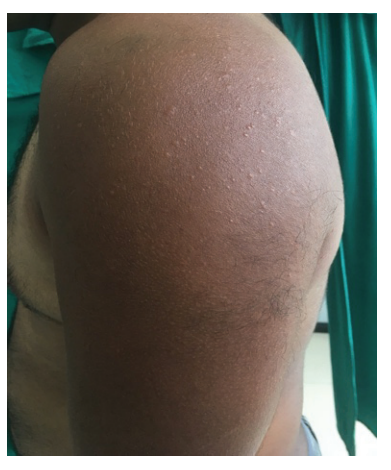
Figure 3: Multiple skin colored non-follicular, papules over upper left upper arm