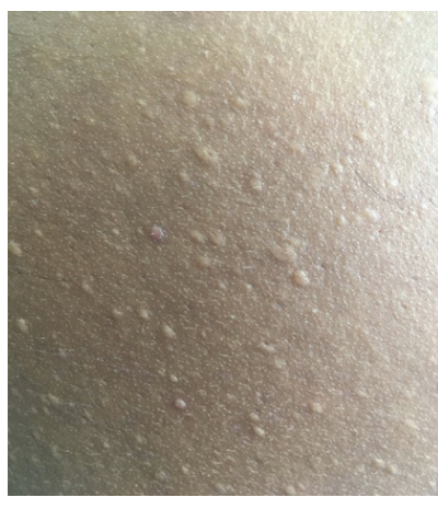
Figure 2: Multiple skin colored non-follicular, papules over back (zoomed in)