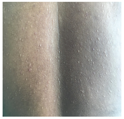
Figure 1: Multiple symmetrical skin colored non-follicular, papules over back

papular elastorrhexis anticipatory treatment can be done. Given the resource limitations of unavailability of electron microscope, definitive confirmation with presence of degenerated elastic tissue from disorganized fibroblast is usually not applicable in our setting. This limitation, highlights the importance of combined use of clinical and histopathological findings in the diagnosis of papular elastorrhexis and hence the timely counselling for expectant management. 5.6