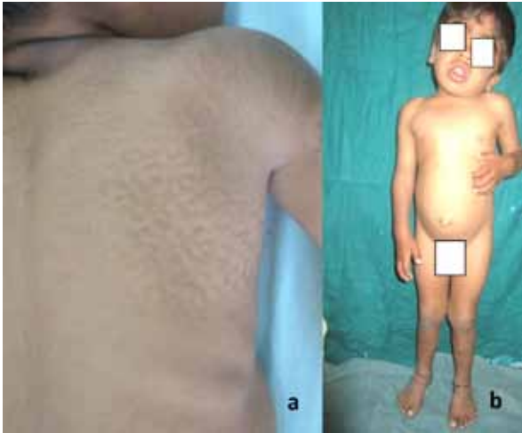
Figure 1(a and b): Typical Phenotype: coarse facial features, depressed nasal bridge, small stubby fingers and protuberant abdomen. Cobblestone appearance of the interscapular skin: Multiple skin colored papules

it was not performed either. Our diagnosis of MPS was confirmed from his history, clinical examination and skeletal survey.