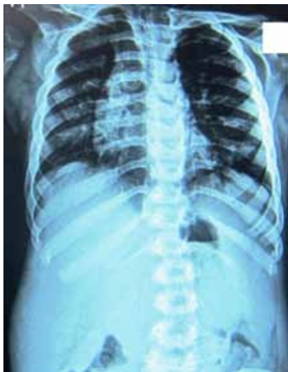
Figure 3: X-Ray chest: Posteroanterior view: Wide ribs with posterior tapering ends (spatulated appearance) and ovoid vertebral bodies.