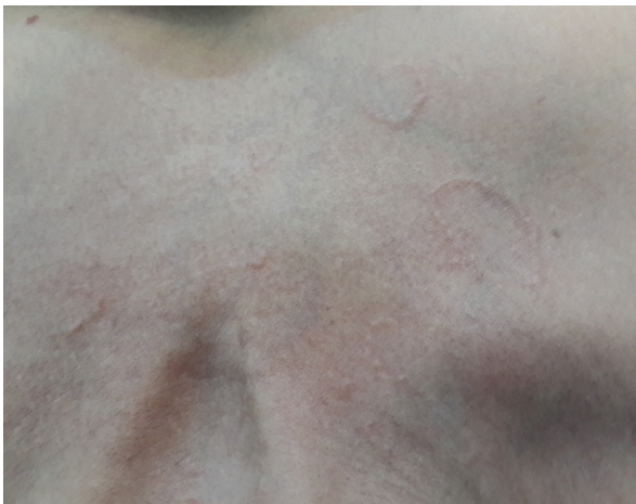
Figure 2: Annular plaques on the chest