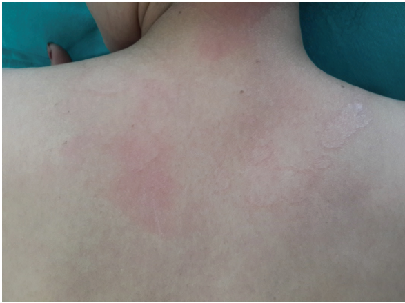
Figure 1: Annular plaques on upper back

The patient was followed up for three months advised with strict photoprotection and intermittent topical steroid use which reduced patient's itching but no improvement on the appearance of the skin lesions. However the number of skin lesions did not increase.