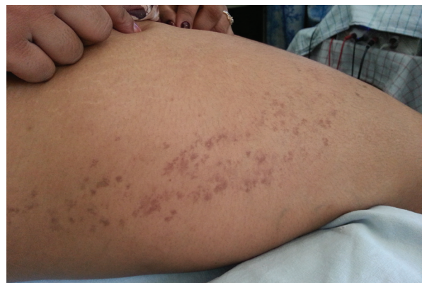
Figure 2: Residual hyperpigmentation of lichen planus lesions on the right thigh.