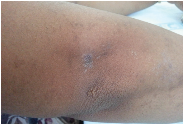
Figure 1: Violaceous plane topped papules on the right arm showing Wickham's striae.