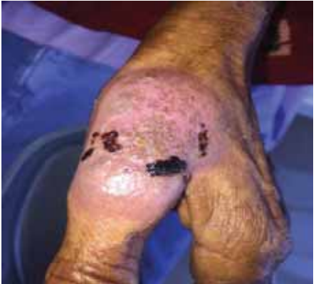
Figure 3: Clinical improvement on Day 2 and Day 4 of starting treatment.