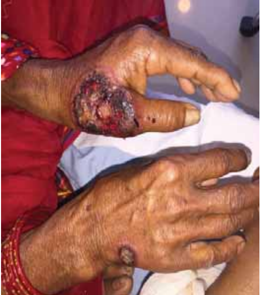
Figure 1: Large ulceronecrotic lesions with edematous violaceous border on dorsa of hands and feet. Single vegetative lesion on dorsum of right hand