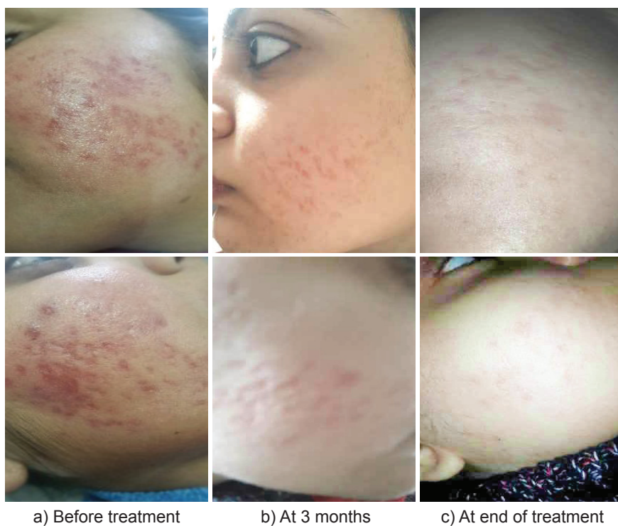
Figure 3: Serial photographs of 23 yrs old female treated with PRP and Skin Needling