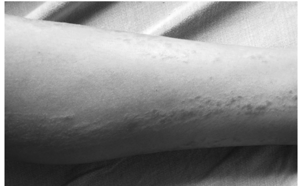
Figure 2: Lesions over postero-medial part of left lower leg