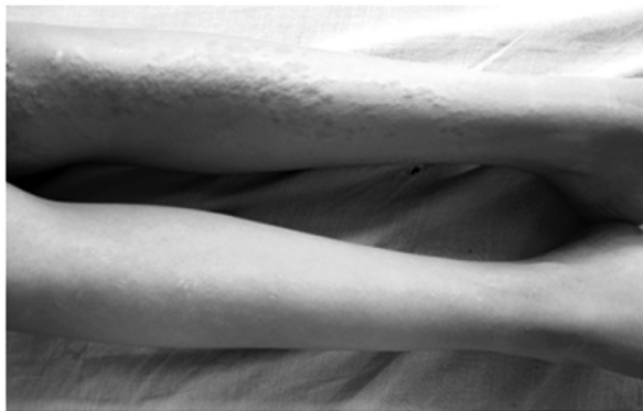
Figure 1: Lesions over anterior part of lower leg

The diagnosis is usually made clinically, which is further supported by the appearance of the primary lesions and the distinctive pattern of evolution of the lesions. Its distribution along the Blaschko's lines and the age of the patient help to narrow down the differential diagnosis. But skin biopsy may be needed sometimes to rule out other lichenoid dermatoses in doubtful situation. Spontaneous resolution may occur in most of the cases within 3–6 months. Since it is a self-limited condition, treatment is generally not necessary. But, Symptomatic control of pruritus with topical steroids may be necessary in some of the cases. 1