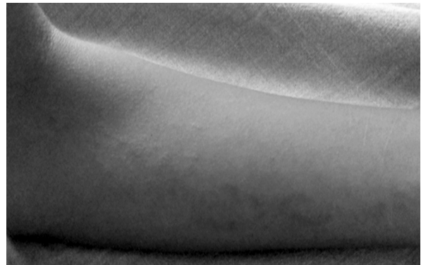
Figure 4: Lesions over medial forearm (left)