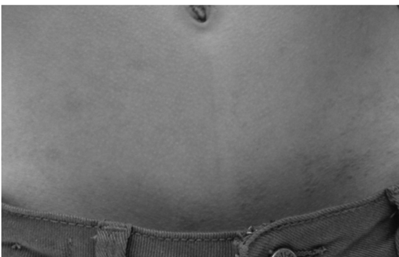
Figure 5: Lesions over anterior abdomen (left)