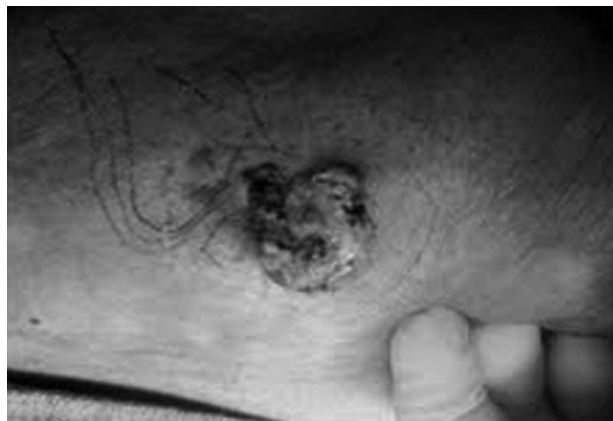
Figure 1: Friable, exophytic lesion of clinically suspected squamous cell carcinoma, with surrounding erythema ab igne.