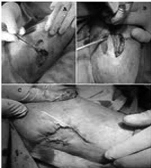
Figure 3: Lesion excised in Toto and closed with transposition flap.