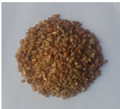
Photograph 4. Red rice variety ( Jumli Rato Marsi )

The phenolic content of Marsi was compared to that of other rice varieties. Only BR had a higher phenolic content than that of Marsi rice variety, which was 22.75 \pm 0.02 GAE/100 g. The lowest phenolic content was found in TR, which was 9.36 \pm 0.01 GAE/100 g. Similar findings of the phenolic content and antioxidant were found in another study on pigmented rice varieties [27] [29]. All the results from this study were found to be similar to the