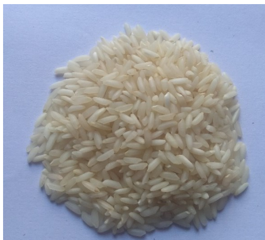
Photograph 2. Khumal-4 rice variety