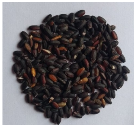
Photograph 1. Black rice variety

was 8.13 \pm 0.01\% . The DPPH radical scavenging activity was found higher in BR variety (59.02 to 75.52%) with the highest observed in aromatic black rice Poireiton chakhao (75.52%) [26]. Another study reported that the DPPH scavenging activity of red rice, parboiled rice, and Sona Masuri were 57.06%, 9.13%, and 16.38%, respectively [18,29].