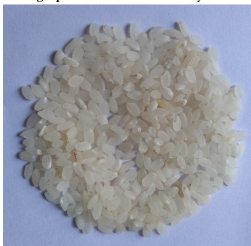
Photograph 3. Taichin rice ( Taichung-176 )