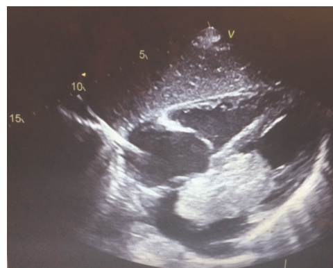
Figure 1: TTE 4-chamber view showing a mass protruding into the mitral valve

myxoma and decided for urgent surgical ablation. The patient underwent sternotomy under cardiopulmonary bypass and bicaval cannulation. We used trans-septal approach: right atriotomy, then opening of atrial septum. Resection of the implantation of the mass on the septum was done and then it was removed from the left atrium (figure 3). The mitral valve was anatomically normal. The postoperative course was uneventful. On day 6, the repeat echocardiogram showed a mild mitral regurgitation and partial recovery from the pulmonary hypertension (PAMP at 29 mm Hg). He was discharged from hospital on the day 7 postoperatively.