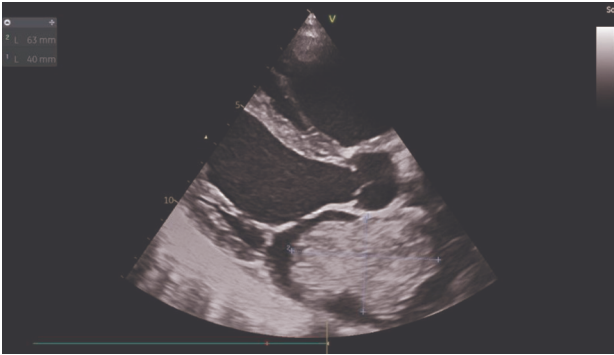
Fig 2: TTE parasternal long axis view showing the giant mass inside the left atrium