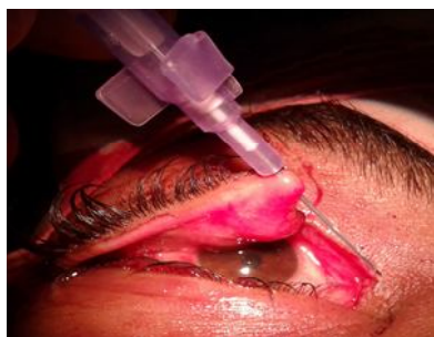
Figure 2 (b): Stellate removed, cut ends of the canaliculus were approximated