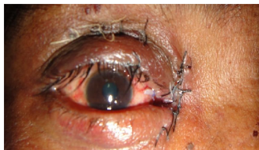
Figure 3: Post operative (Day 10) photograph-tube in situ (arrow).