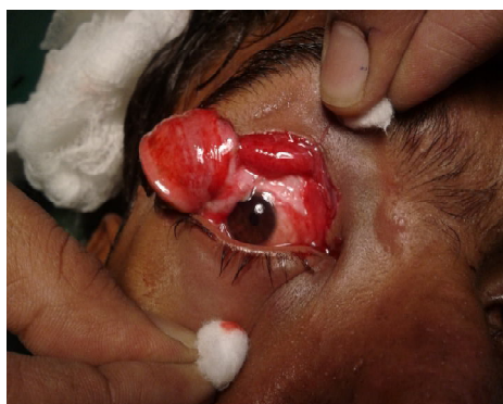
Figure 1: RE upper lid avulsion involving canaliculus

systemic as well as local antibiotic coverage. On the first follow up on postoperative day 10, the tube was in situ (Figure 3). In the 12th week after the surgery, the tube was removed. The patient had a patent canaliculus on syringing, with mild traumatic ptosis. He had no complaint of watering.