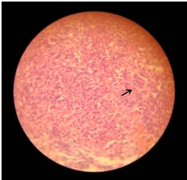
Fig-4: Tubercular granuloma

Fig-3a & 3b: Soft tissue mass at antero-lateral aspect of orbit