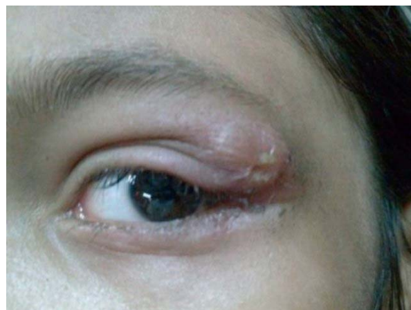
Fig-2: Discharging sinus