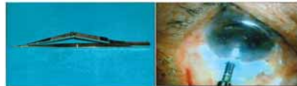
Fig.3 Kelly's Punch