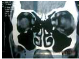
Fig 4b: Coronal Computed Tomography showing mass in medial extraconal space of the same patient