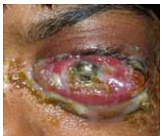
Fig 3a: Rhabdomyosarcoma of left eye.