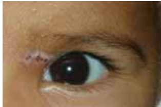
Fig 2b: Postoperative status ( Anterior Orbitotomy) of the same patient.