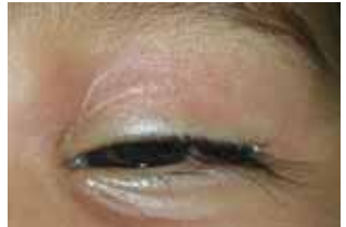
Fig 2a: Superonasal mass in a 2 year old child.