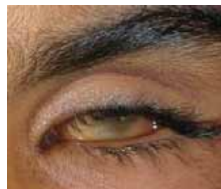
Fig 3b: Post treatment photograph of the same patient.