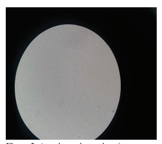
Figure 3: Acanthamoeba trophozoite