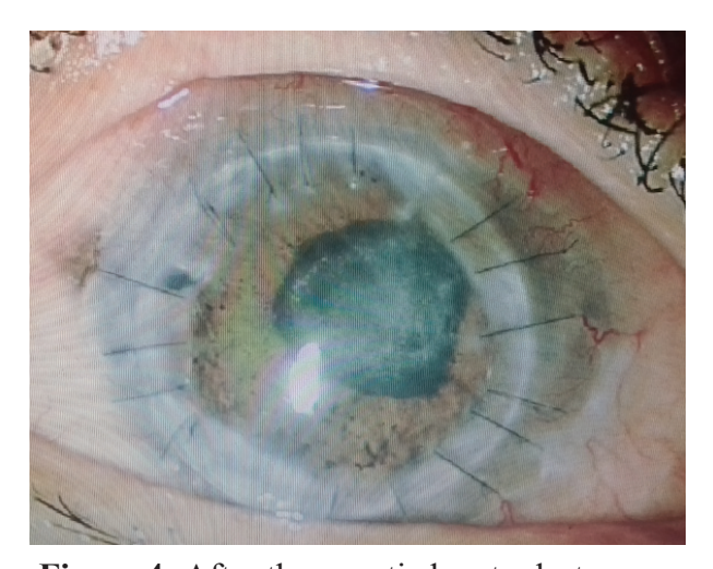
Figure 4: After therapeutic keratoplasty