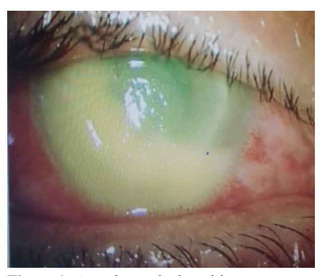
Figure 1: Acanthamoeba keratitis

So rescrapping done suspecting was Acanthamoeba in a non-nutrient agar with a lawn of E. coli. There was presence of motile trophozoites and cyst which was suggestive of acanthamoeba. As the anti amoebic drugs were not available in Nepal, patient was treated with antifungal and antibacterial drugs. But the condition of the patient deteriorated, so therapeutic penetrating keratoplasty performed with antifungal, antibacterial, steroid and antiglaucoma drugs. Patient was stable for a few months. No recurrence of infection. But after 1 year the patient developed failed graft, secondary glaucoma and cataract. So the patient was planned for regraft with lens extraction and intraocular lens.