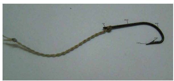
Figure 4: The fish hook which penetrated the globe