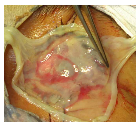
Figure 1: Peroperative photograph showing amniotic membrane of appropriate size ready to be mounted on conformer.