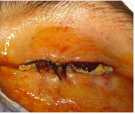
Figure 3: Photograph at completion of surgery with both lid sutures tied to each other to keep conformer and amniotic membrane in place.