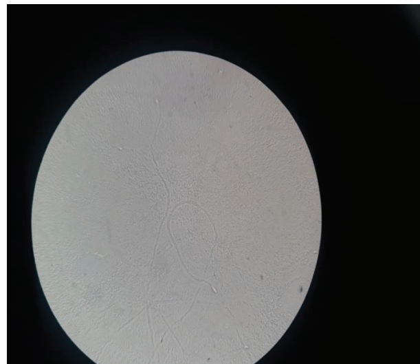
Figure 3: Acanthamoeba trophozoite