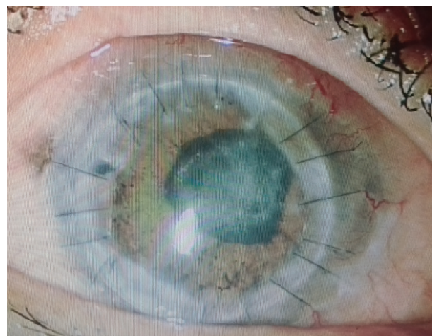
Figure 4: After therapeutic keratoplasty