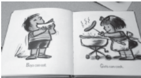
Figure 1 Boys are active and dominant, whereas girls are submissive and domestic

As exaggerated images of men/women or boys/girls are deployed repeatedly in routine life, it most obviously becomes an inherited habit—a legacy that each individual inherits. Surely, stereotyping arises outside of conscious awareness and as a part of “natural” social and cultural interface, which must be truly discarded. This is possible if gender conscientious education is initiated, which could eventually create level-headed individuals. In fact, stereotyping is not only hurtful, it is also wrong. Besides, it can also