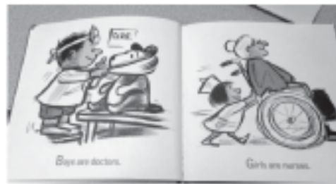
Figure 2: Boys are encouraged to take careers where the demand is to be brave and daring, whereas girls are propagandized to take submissive and passive career roles

A stereotyped image—of a man or a woman’s performance, behavior, attitude, and aptitude—in today’s world, is generally communicated via the visual mass media.