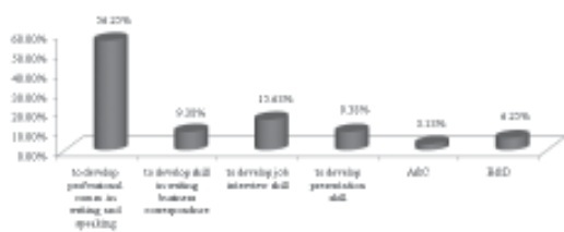
Figure 1. Reasons for an ESP course

Similarly, the next question asked was if they knew how the students want the instructional materials to be delivered. 43.75% students wanted the instructional materials to be delivered face to face, and 57.25% students wanted the instructional materials to be delivered through online and multimedia. In the seventh question, the students were inquired of the type of classroom they want for the Technical Writing and Communications course. In reply, 37.5% students preferred classroom with white-boards and OHP, 12% students wanted classroom multimedia facilitated with sound system, 25% demanded internet and multimedia facilitated classroom with sound system, and 25% students desired internet and multimedia facilitated classroom with sound system and decorated with posters and maps. In the eighth question, the students were asked what kind of English class the students like. In reply, 87.5% students preferred class with lot of activities, pair/group work and projects. Then the participants were asked