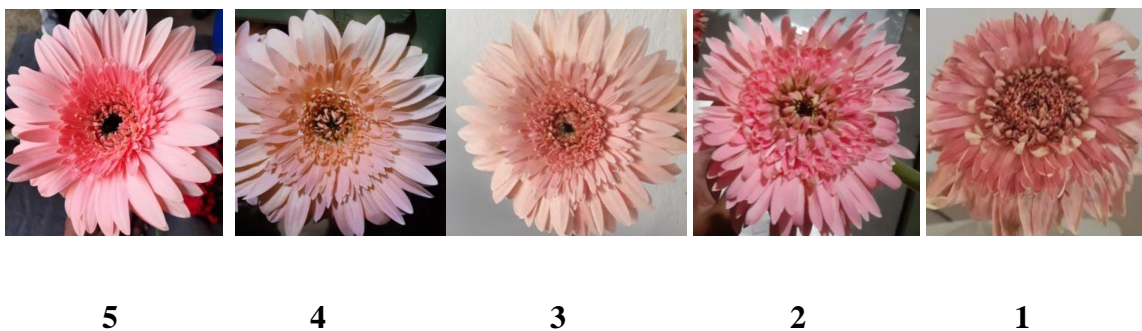
Figure 2. Vase life evaluation of cv. Rosalin