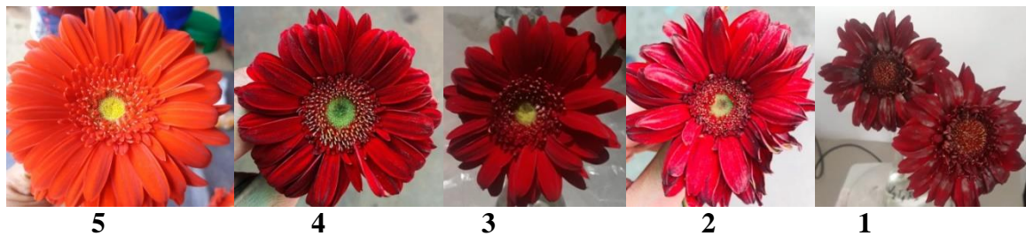
Figure 1. Vase life evaluation of cv. Carambole

Flower quality was observed daily in the observation room. On the visual basis, vase life evaluation was scored as 5-1 (Figure 1, 2). Grade 5 was considered as the best quality of flower whereas grade 1 as the vase life termination stage (Acharya et al 2010). Stem of the flower was examined visually for the sign of rotting. Vase life was recorded as the time period when more than one third of the outer petals of inflorescence started to be brown or wilted.