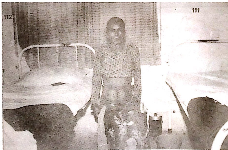
Picture of patient after Surgery