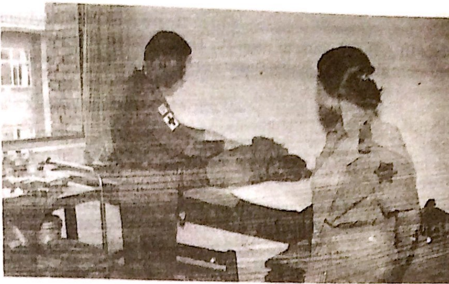
Picture of Lung Cancer patient recovering after surgery