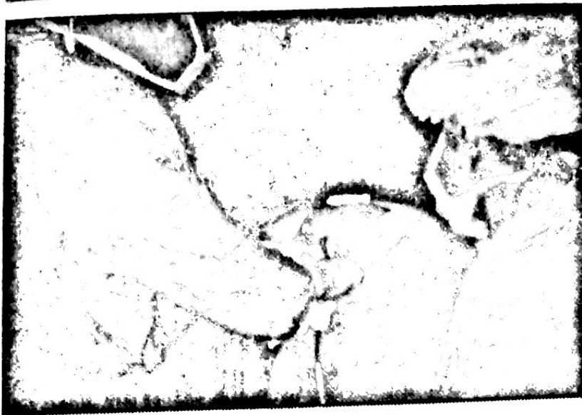
Thoracostomy Tube Drainage (Water Seal Chest Tube Drainage) A Life Saving Surgical Procedure

During the reinsertion of forceps along with chest tube it is usually difficult to find the old pleural hole due to bleeding and discharge of fluid in the surgical field in acutely respiratory distressed patient with curved artery forceps with it's wide open tips.