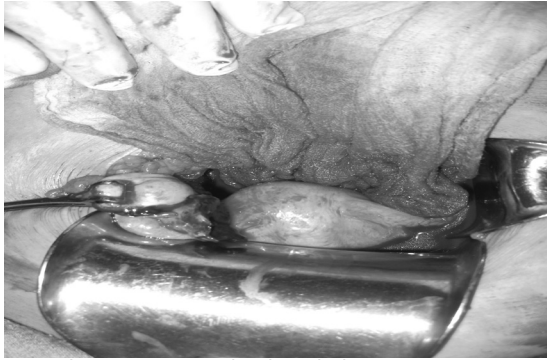
Fig1. Showing ruptured right sided ectopic pregnancy.